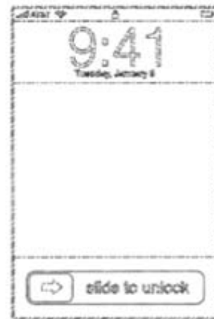
Apple's US D675,639 Slide-to-Unlock Design Patent

Design patents are governed by 35 U.S.C. §171, which provides that: [w]hoever invents any new, original and ornamental design for an article of manufacture may obtain a patent therefor, subject to the conditions and requirements of this title. According to In re Zahn , 617 F.2d 261, 204 USPQ 988 (CCPA 1980), 35 U.S.C. §171 refers not to the design of an article but to the design for an article, and is inclusive of ornamental designs of all kinds, including surface ornamentation as well as configuration of goods.