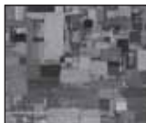
Our Time, 32 1/4" x 38", collage on board is by Lance Letscher. Courtesy of d berman gallery.