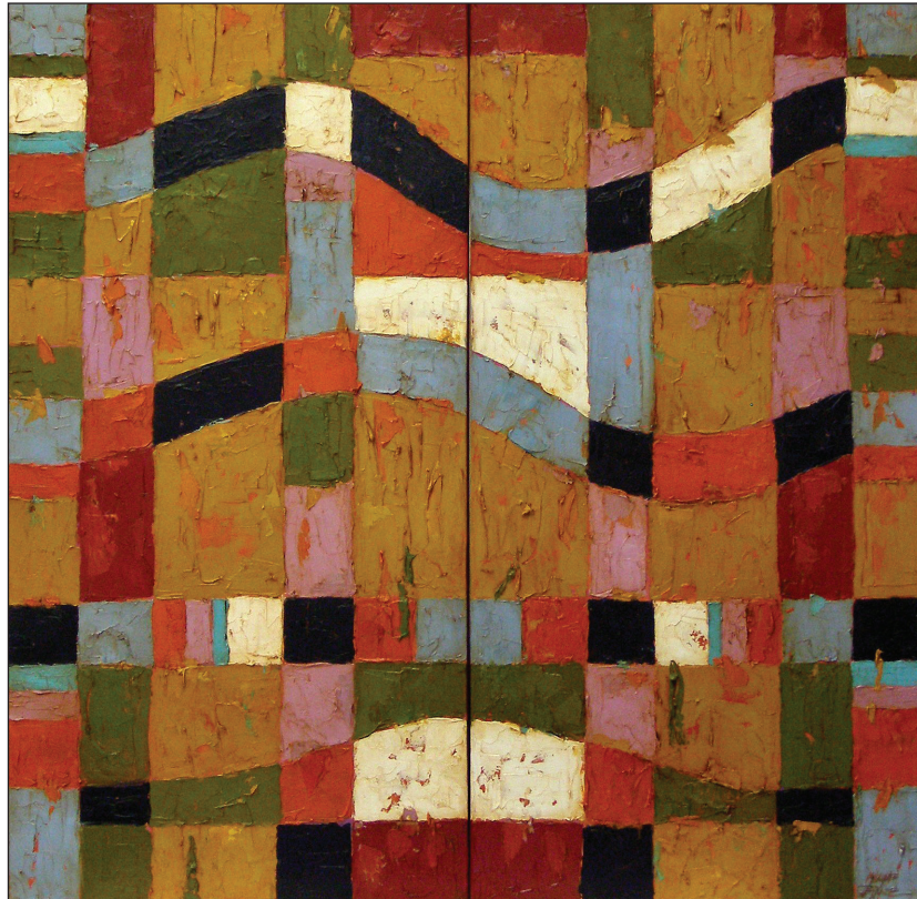
Topsy Turvy by Maxine Price

November 11*, 12–13, 2015 Four Seasons Hotel Austin, Texas