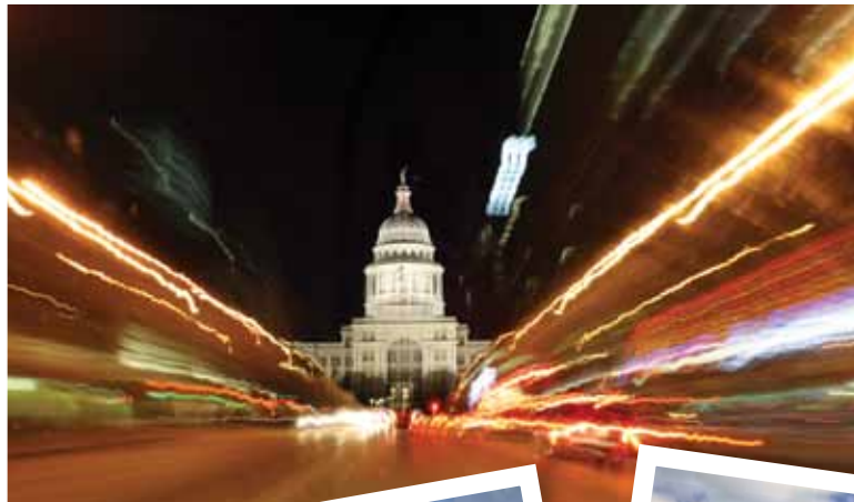
ACLE photo: Dan Heron, HeronBook.com

October 21, 2010, 9 a.m. Conference begins