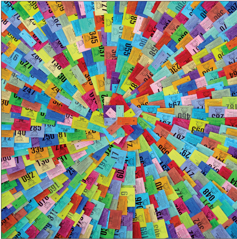
Valet, 36" x 36", collage of parking tickets and acrylic, Philip Durst

October 23–24, 2014 Four Seasons Hotel ■ Austin, Texas