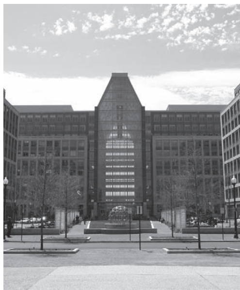
USPTO Campus • Alexandria, VA

• • • • • Phone: 512-475-6700 Fax: 512-475-6876