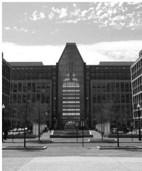
USPTO Campus • Alexandria, VA