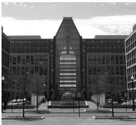
USPTO Campus • Alexandria, VA