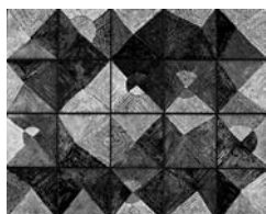
"Patterns", 2006, oil on metal, 37" x 45", is by Joseph Janson. For more information, visit www.dbermangallery.com