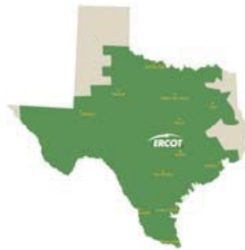
ERCOT SERVICE AREA