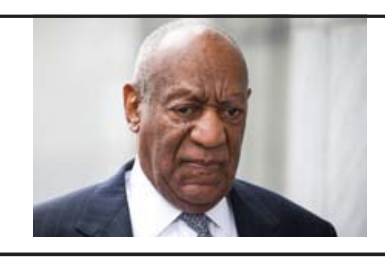
#BalanceTonPorc "out your pig"