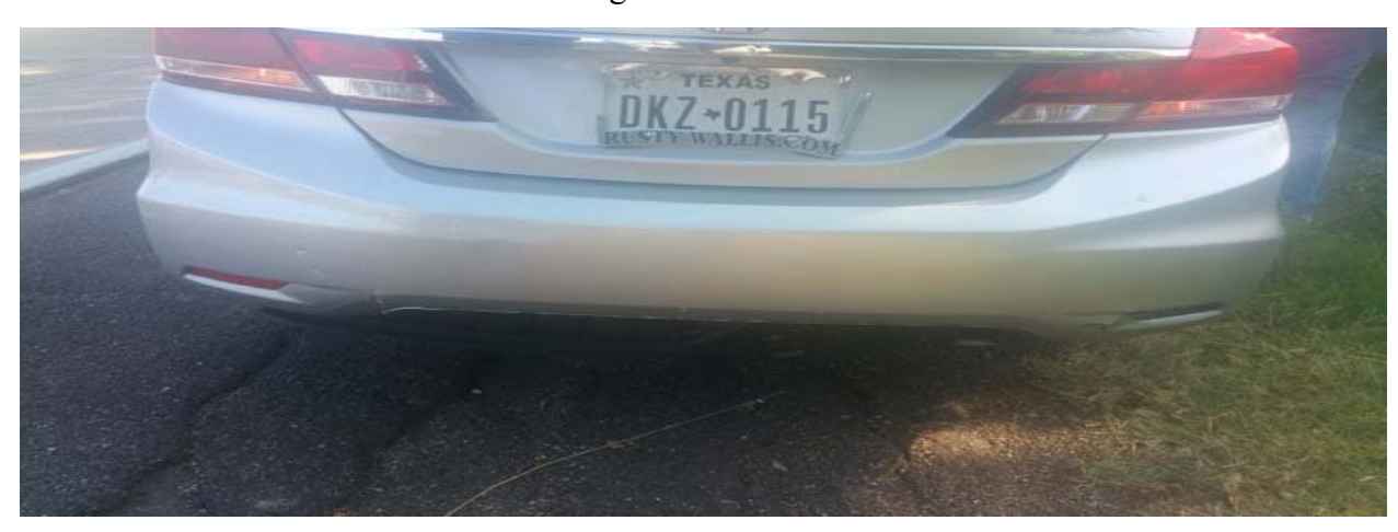
Damage We "See" Often – Minimal Visible Damage