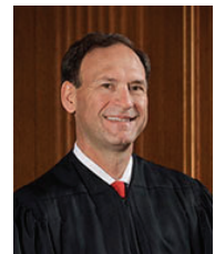
Samuel A. Alito, Jr., Associate Justice