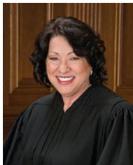
Sonia Sotomayor, Associate Justice