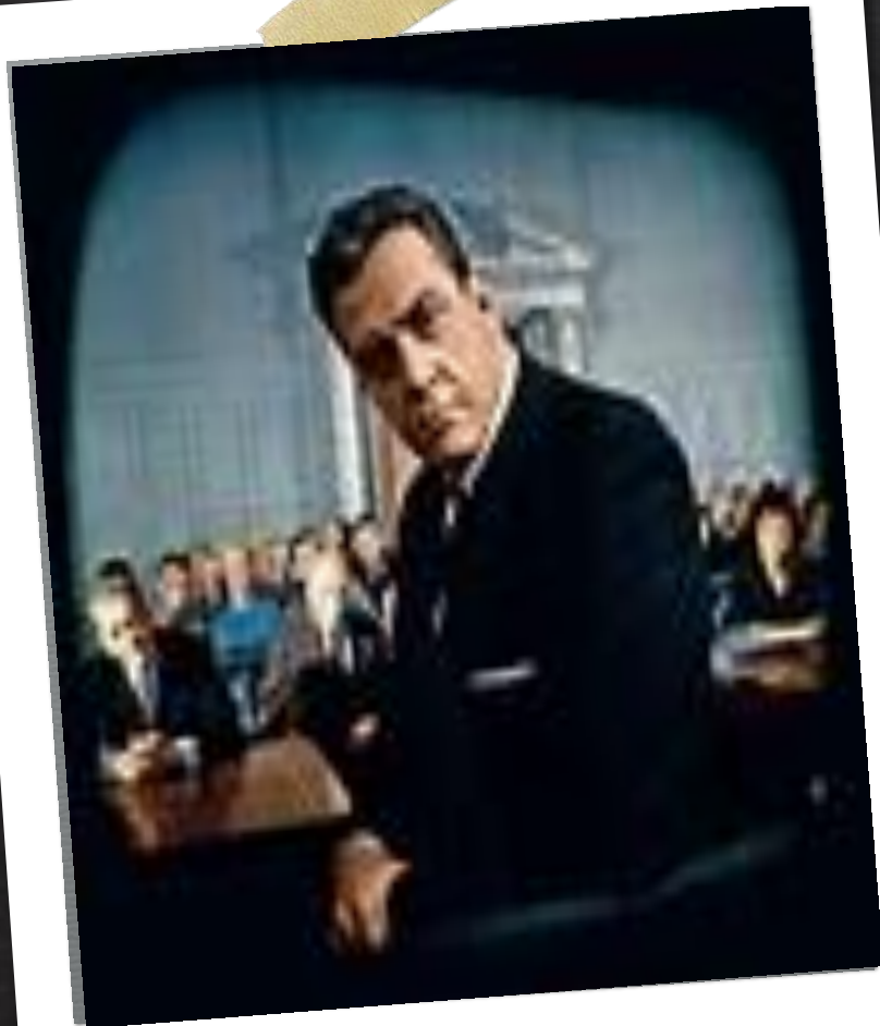
(THIS IS PERRY MASON)

WE'RE ALL FAMILIAR WITH THIS THE ATTORNEY ON THE COURT DRAMA OBJECTS ON THE GROUND HEARSAY; THE OPPOSING COUNSEL BACK A WITTY RESPONSE AND T DECIDES WHETHER THE TESTIMONY ADMISSIBLE OR NOT. DURING PER THIS SCENE SERVES TO THICKEN BUT IF YOU ARE REPRESENTING CLIENT, UNDERSTANDING WHEN ON THE GROUNDS OF HEARSAY A ARGUE THE VARIOUS EXCEPTIONS RULE CAN MAKE THE DIFFERENCE BETWEEN WINNING AND LOSING.