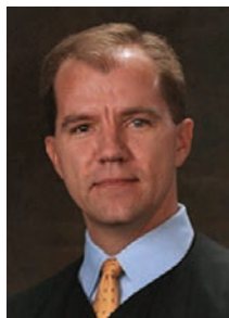
Judge Don Willett