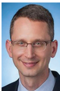
Judge Kyle Duncan