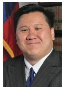
Judge James Ho