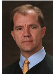
Judge Don Willett