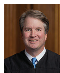
Brett M. Kavanaugh, Associate Justice