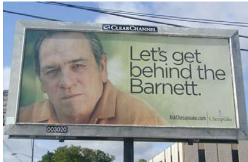
Fort Worth, Texas circa 2006