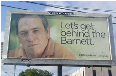
Fort Worth, Texas circa 2006