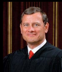
Chief Justice John G. Roberts Jr.

“The amendments may not look like a big deal at first glance, but they are.”