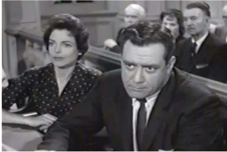
From Perry Mason (TV Series, 1957–1966)