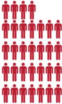
Scenario 1: Repeal +32 million

Increase in the uninsured compared with ACA, by 2026 (millions)