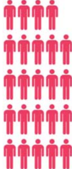
American Health Care Act +24 million