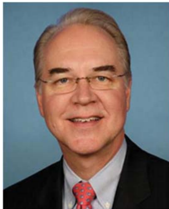
Dr. Tom Price HHS Secretary