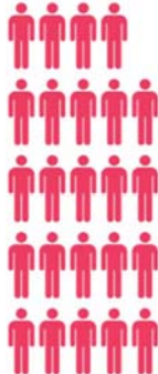
American Health Care Act +24 million