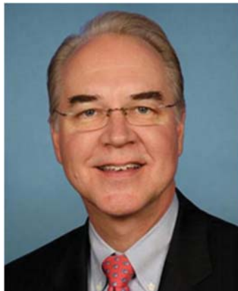
Dr. Tom Price HHS Secretary