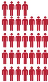
Scenario 1: Repeal +32 million

Increase in the uninsured compared with ACA, by 2026 (millions)