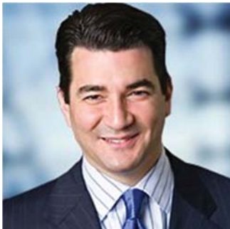
Dr. Scott Gottlieb Nominee for FDA Commissioner