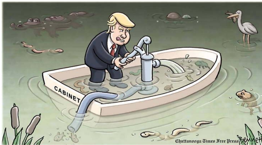
Draining the Swamp