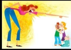
what my mother in law thinks I do