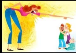
what my mother in law thinks I do