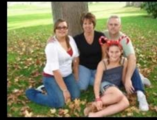
what I really do