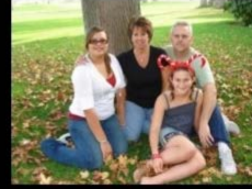
what I really do