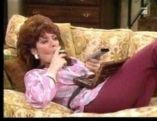
what the birthmother thinks I do