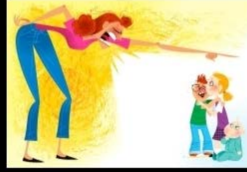
what my mother in law thinks I do