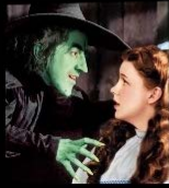
what my stepkids think I do