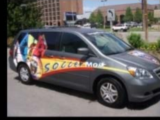
what my husband thinks I do