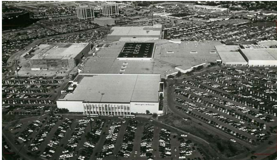
Valley View Mall Dallas Texas Circa 1982