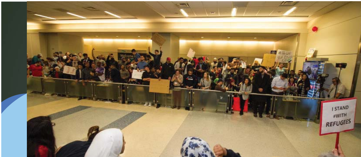
Trump's Travel Ban- January 2017