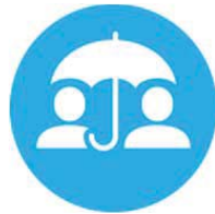
Two Types of Coverage