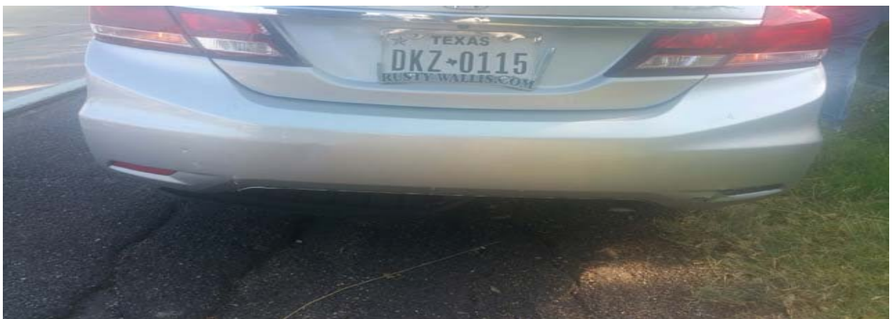
Damage We “See” Often – Minimal Visible Damage