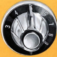
1958 IMPERIAL AUTO-PILOT CONTROL DIAL

Acclaimed by experts as one of the greatest automotive inventions ever developed