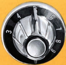
1958 IMPERIAL AUTO-PILOT CONTROL DIAL

Acclaimed by experts as one of the greatest automotive inventions ever developed