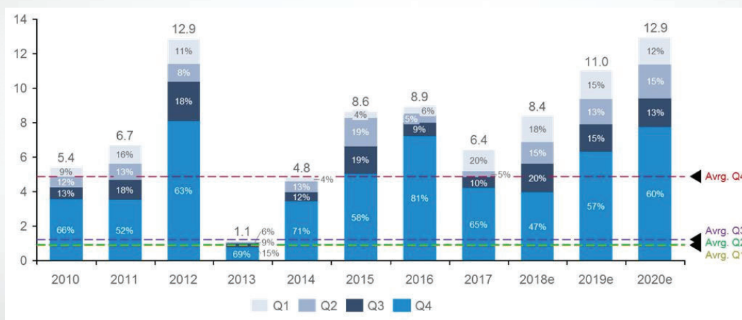
(NOTE: Forecast estimates reflect the Q2 2018 Market Outlook Update)