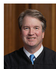
Brett M. Kavanaugh, Associate Justice