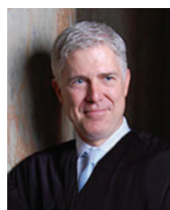
Neil M. Gorsuch, Associate Justice