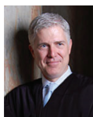
Neil M. Gorsuch, Associate Justice