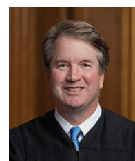
Brett M. Kavanaugh, Associate Justice