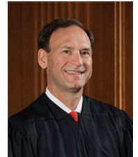
Samuel A. Alito, Jr., Associate Justice