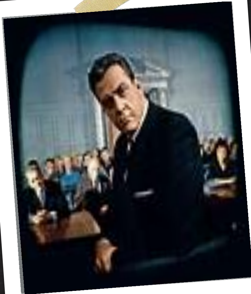
(THIS IS PERRY MASON)

WE'RE ALL FAMILIAR WITH THIS THE ATTORNEY ON THE COURT DRAMA OBJECTS ON THE GROUND HEARSAY; THE OPPOSING COUNSEL BACK A WITTY RESPONSE AND T DECIDES WHETHER THE TESTIMONY ADMISSIBLE OR NOT. DURING PER THIS SCENE SERVES TO THICKEN BUT IF YOU ARE REPRESENTING CLIENT, UNDERSTANDING WHEN ON THE GROUNDS OF HEARSAY A ARGUE THE VARIOUS EXCEPTIONS RULE CAN MAKE THE DIFFERENCE BETWEEN WINNING AND LOSING.