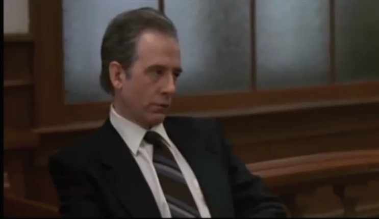
From My Cousin Vinny , 1992