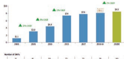
AUM (US$tn) Growth of Sovereign Wealth Funds*