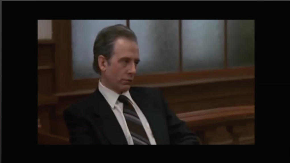
From My Cousin Vinny , 1992