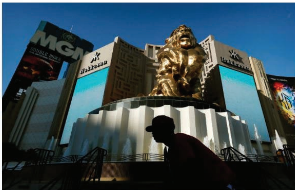
MGM Resorts International acknowledged that it was the victim of a data breach last year. A firm that monitors cybercrimes said 10.6 million people were affected.

Researchers have found 142 million personal details from former guests at the MGM Resorts hotels for sale on the Dark Web, evidence that a data leak from the hotel chain last summer may be far bigger in scope than previously thought.