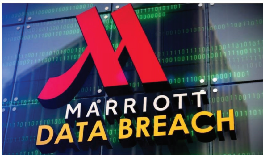
Marriott Data Breach 2020

Hackers obtained login credentials of two accounts of Marriott employees who had access to customer information regarding the loyalty scheme of the hotel chain. They used the information to siphon off the data approximately a month before the breach was discovered.