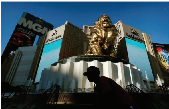
MGM Resorts International acknowledged that it was the victim of a data breach last year. A firm that monitors cybercrimes said 10.6 million people were affected.

Researchers have found 142 million personal details from former guests at the MGM Resorts hotels for sale on the Dark Web, evidence that a data leak from the hotel chain last summer may be far bigger in scope than previously thought.