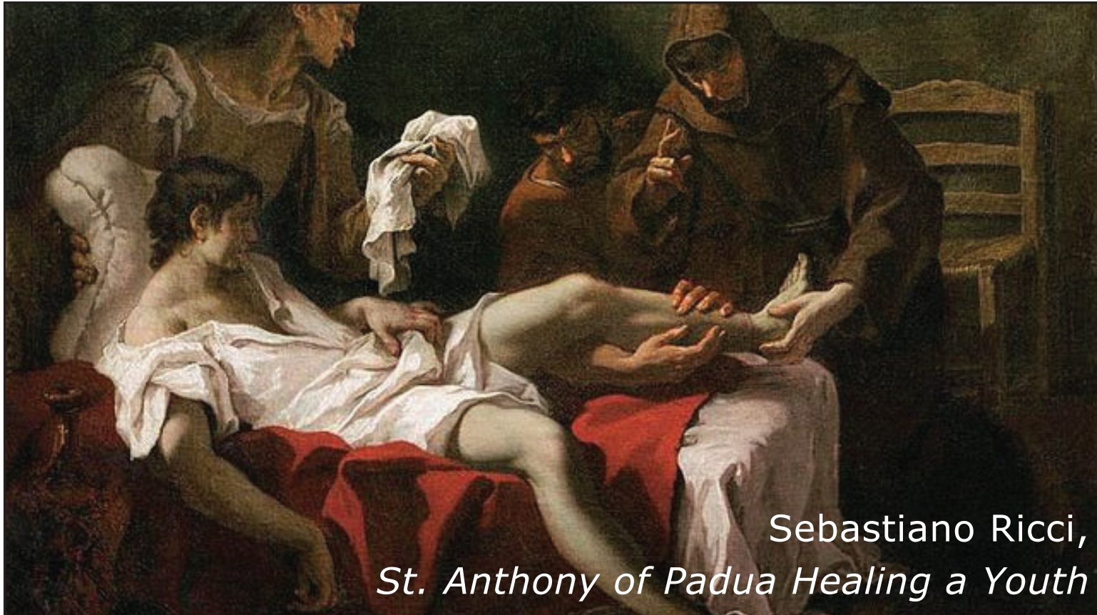
Sebastiano Ricci, St. Anthony of Padua Healing a Youth