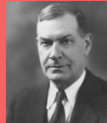
Senator Wesley Jones (R-Wa.)