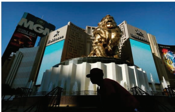
MGM Resorts International acknowledged that it was the victim of a data breach last year. A firm that monitors cybercrimes said 10.6 million people were affected.

Researchers have found 142 million personal details from former guests at the MGM Resorts hotels for sale on the Dark Web, evidence that a data leak from the hotel chain last summer may be far bigger in scope than previously thought.