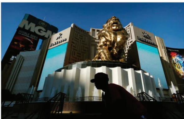
MGM Resorts International acknowledged that it was the victim of a data breach last year. A firm that monitors cybercrimes said 10.6 million people were affected.