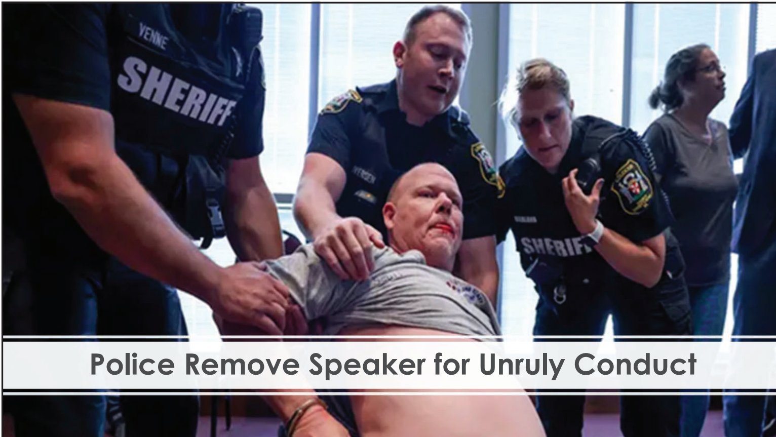
Police Remove Speaker for Unruly Conduct