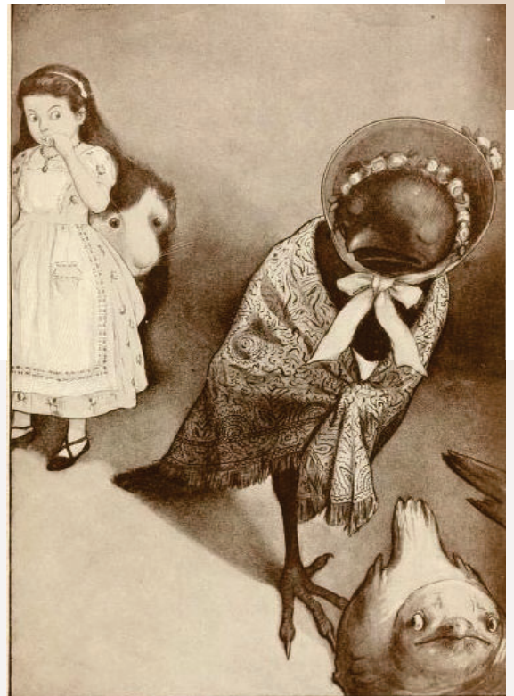
“On various pretexts they all moved off.” Lewis Carroll's Alice in Wonderland, illustration by Peter Newell.