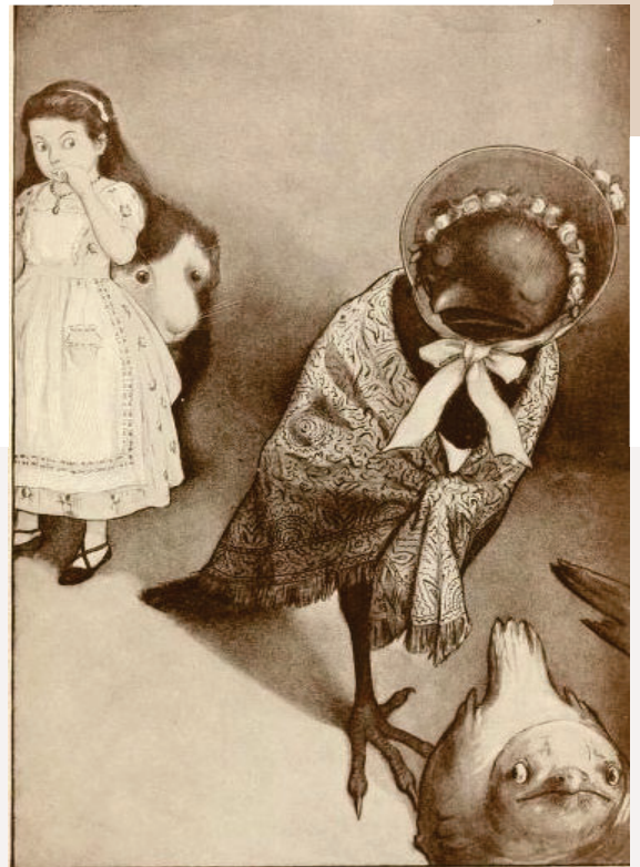
“On various pretexts they all moved off.” Lewis Carrol’s Alice in Wonderland, illustration by Peter Newell.