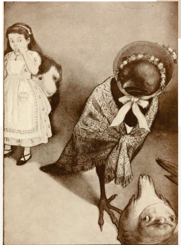
“On various pretexts they all moved off.” Lewis Carroll's Alice in Wonderland, illustration by Peter Newell.