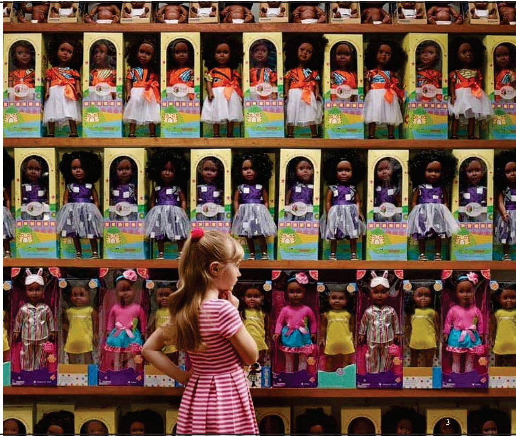
"Let's Talk About Race" Photo Series by Chris Buck & Greg Semu