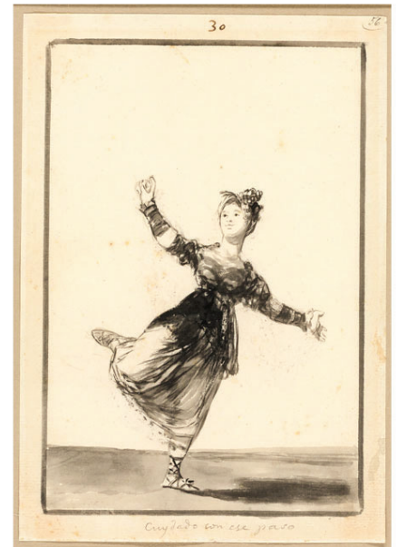
Francisco José de Goya y Lucientes . Be Careful with that Step! 1816–1820. The Art Institute of Chicago.