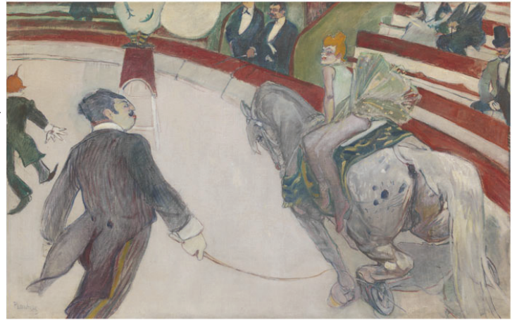
Henri de Toulouse-Lautrec , Equestrienne (At the Cirque Fernando) , 1882–1892. The Art Institute of Chicago.

A writ of mandamus is “[a] writ issued by a court to compel performance of a particular act by a lower court or a governmental officer or body, usu[ally] to correct a prior action or failure to act.” Mandamus , Black’s Law Dictionary 973 (11th ed. 2019).