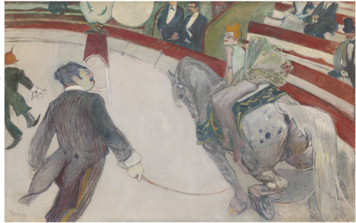
Henri de Toulouse-Lautrec , Equestrienne (At the Cirque Fernando) , 1882–1892. The Art Institute of Chicago.

A writ of mandamus is “[a] writ issued by a court to compel performance of a particular act by a lower court or a governmental officer or body, usu[ally] to correct a prior action or failure to act.” Mandamus , Black’s Law Dictionary 973 (11th ed. 2019).