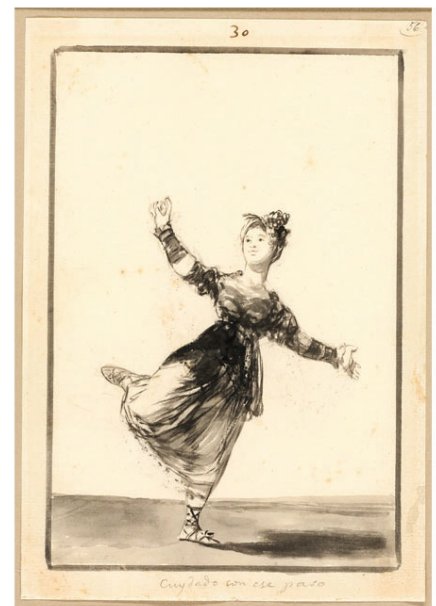
Francisco José de Goya y Lucientes . Be Careful with that Step! 1816–1820. The Art Institute of Chicago.