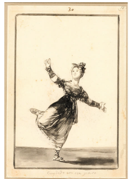
Francisco José de Goya y Lucientes , Be Careful with that Step! 1816–1820. The Art Institute of Chicago.