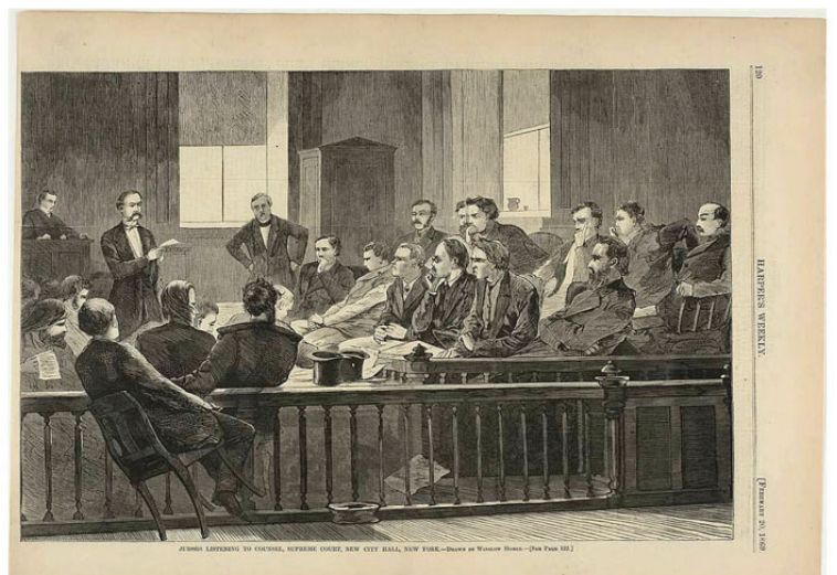
Winslow Homer. Jurors Listening to Counsel, Supreme Court, New City Hall, New York. Published 1869. The Art Institute of Chicago.

In re State ex rel. Best , 616 S.W.3d 594, 599 (Tex. Crim. App. 2021)