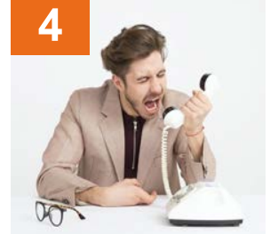
Handling Client Complaints