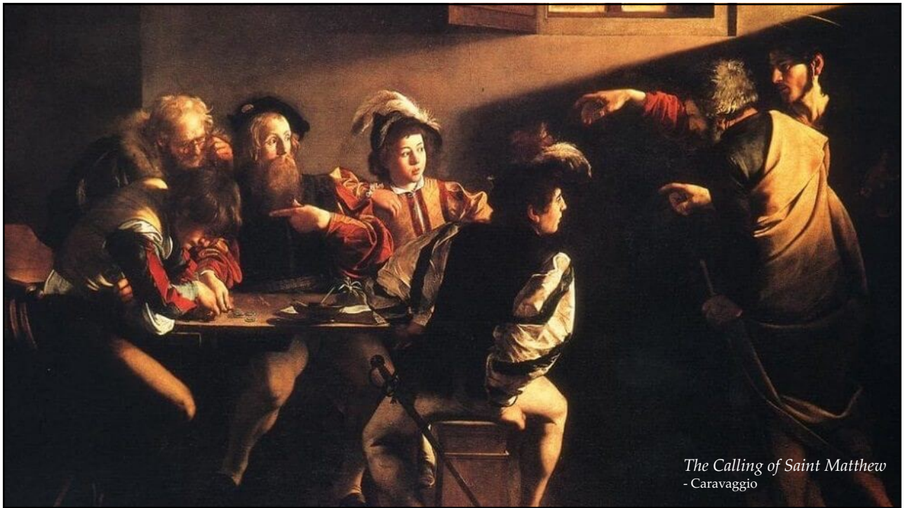
The Calling of Saint Matthew - Caravaggio