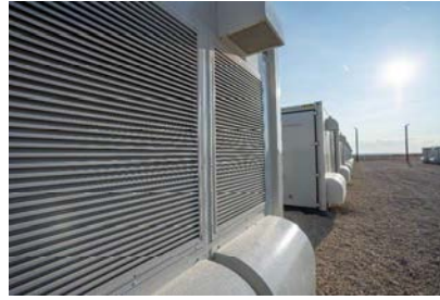
Flower Valley II 100 MW, 200 MWh