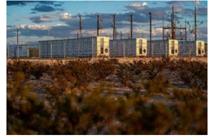
Swoose II 100 MW, 200 MWh