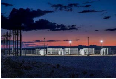
Tripe Butte I 7.5 MW, 15 MWh