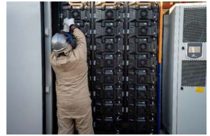
Swoose I 9.9 MW, 19.8 MWh

All material inside this deck is confidential. Please do not distribute without permission of Jupiter Power LLC.