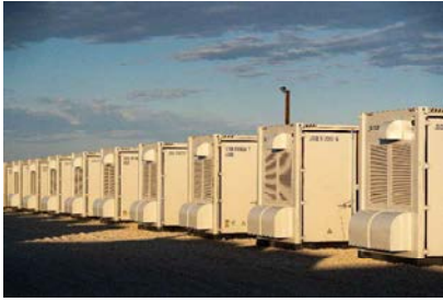
Crossett 200 MW, 200 MWh