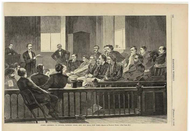
Winslow Homer. Jurors Listening to Counsel, Supreme Court, New City Hall, New York. Published 1869. The Art Institute of Chicago.

In re State ex rel. Best , 616 S.W.3d 594, 599 (Tex. Crim. App. 2021)