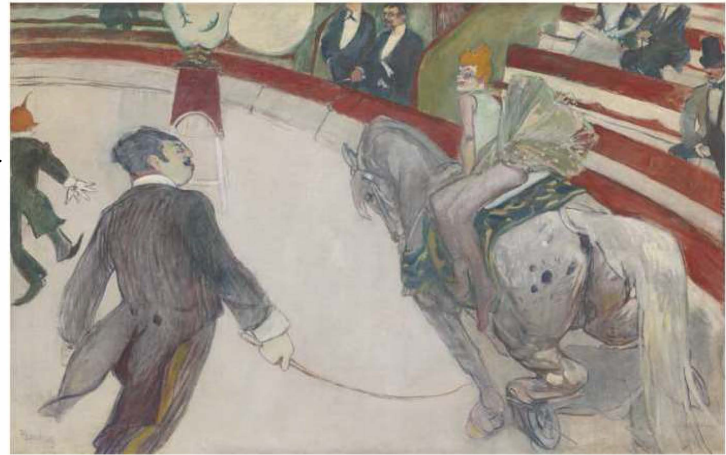
Henri de Toulouse-Lautrec , Equestrienne (At the Cirque Fernando) , 1882–1892, The Art Institute of Chicago.

A writ of mandamus is “[a] writ issued by a court to compel performance of a particular act by a lower court or a governmental officer or body, usu[ally] to correct a prior action or failure to act.” Mandamus , Black’s Law Dictionary 973 (11th ed. 2019).