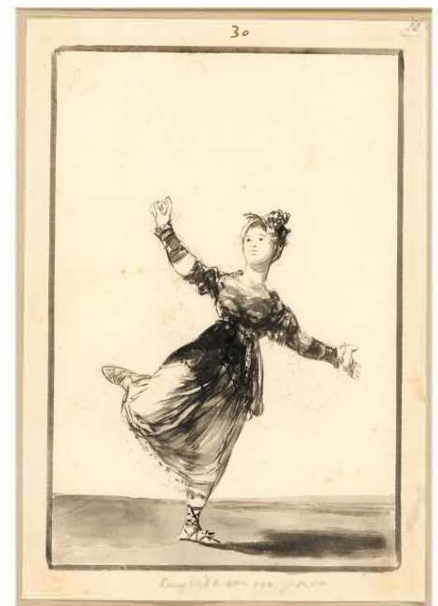
Francisco José de Goya y Lucientes , Be Careful with that Step! 1816–1820, The Art Institute of Chicago.