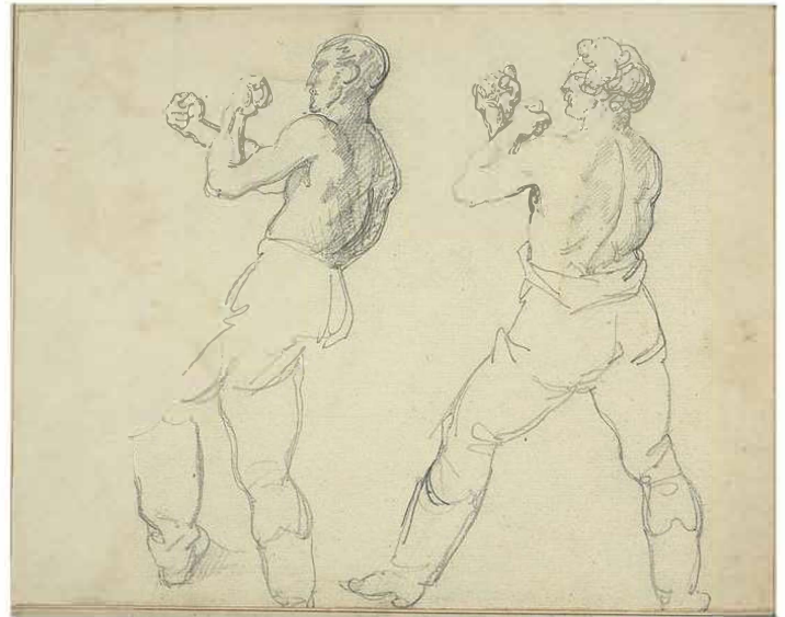
Jean Louis André Théodore Géricault. Two Boxers Facing Left. 1818–1824. The Art Institute of Chicago.