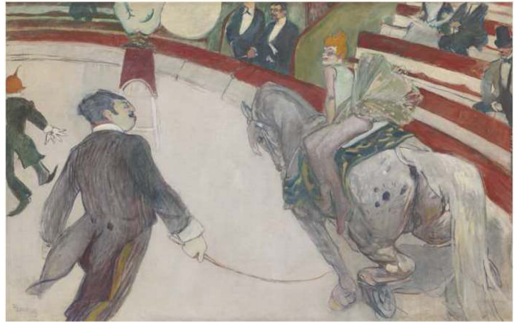
Henri de Toulouse-Lautrec , Equestrienne (At the Cirque Fernando) , 1882–1892, The Art Institute of Chicago.

A writ of mandamus is “[a] writ issued by a court to compel performance of a particular act by a lower court or a governmental officer or body, usu[ally] to correct a prior action or failure to act.” Mandamus , Black’s Law Dictionary 973 (11th ed. 2019).