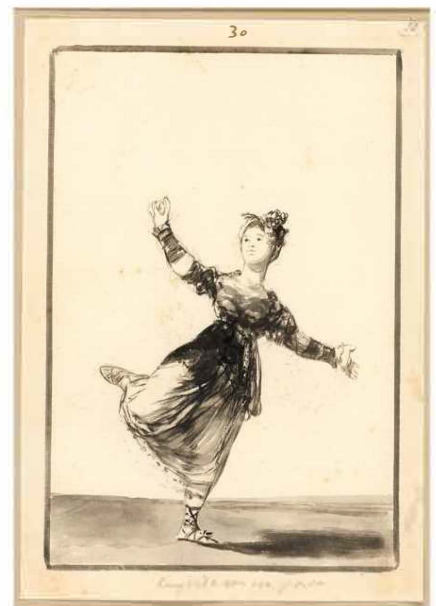
Francisco José de Goya y Lucientes , Be Careful with that Step! 1816–1820, The Art Institute of Chicago.