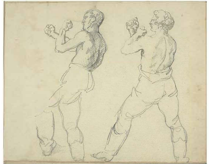
Jean Louis André Théodore Géricault. Two Boxers Facing Left. 1818–1824. The Art Institute of Chicago.