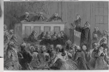
"By no means," continued Alton, in his slow, steady, solemn voice. "It is not the law, printing and publishing of a paper that will make it a fact; the words themselves must be taken, and in their construction and contents, and the sense in which they are used." (Page 108)