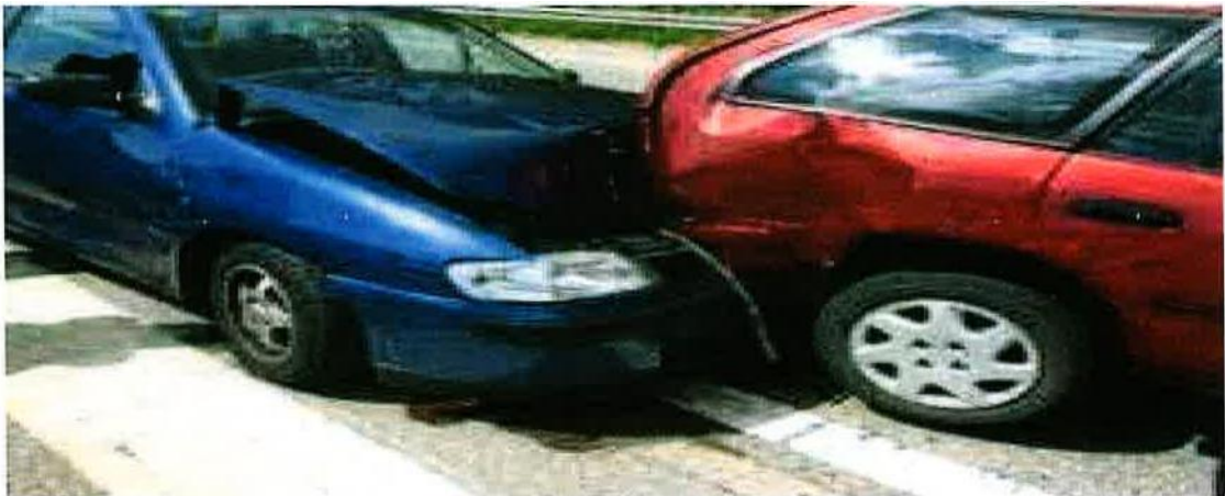
Damage We Like To See