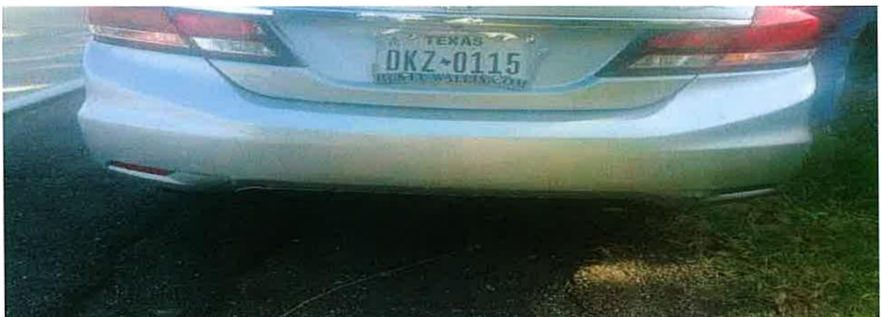
Damage We Often "See"